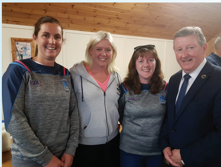
Meeting St Fursey's Ladies Football Committee