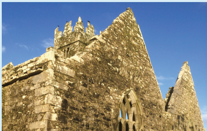
Tourism potential for Ross Errilly Friary

I have been in contact with Galway County Council , the Environment Protection Agency and Inland Fisheries Ireland to ask them to ensure this issue is dealt with prior to any of these risks becoming a reality.