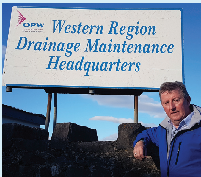
Office of Public Works, Headford

● Headford received funding of €100,000 under the Town and Village Renewal Scheme for a range of improvements, including upgrading and redesigning public lighting, enhanced amenities and infrastructural changes to encourage young families and retirees to settle in the town.