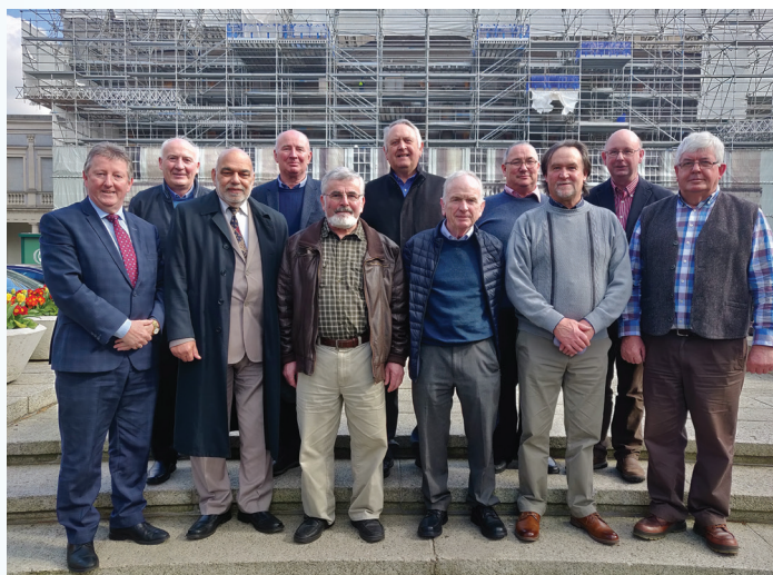
Headford Men's Shed visiting Leinster House