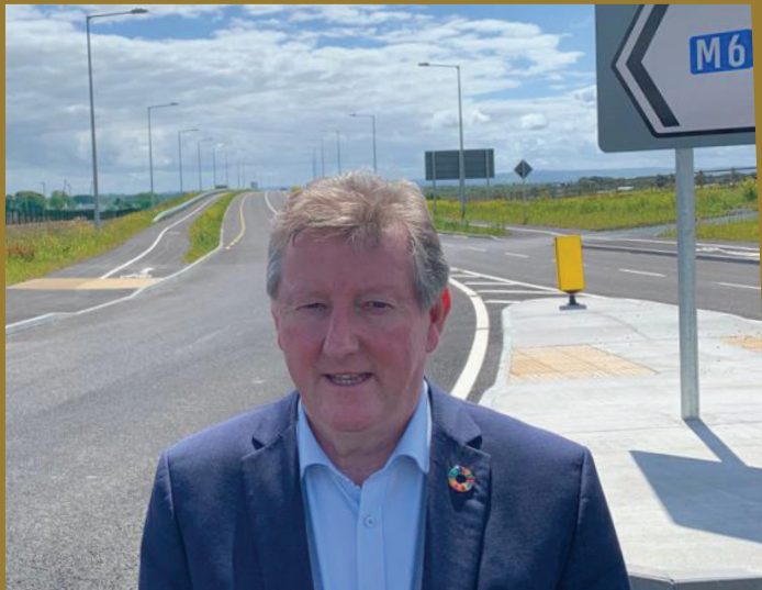
Athenry Link Road

The IDA site at Athenry should be ready and fully serviced so that the town can reap a jobs dividend from foreign direct investment. The site is pivotal for job creation.