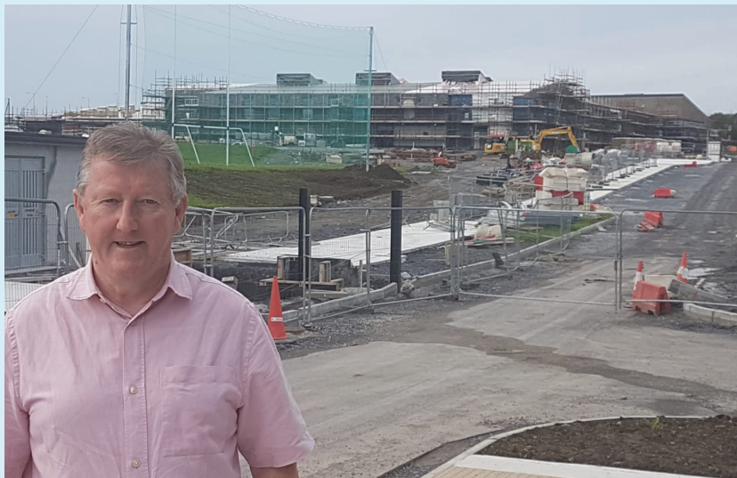
The new school building works under way for Clarin College