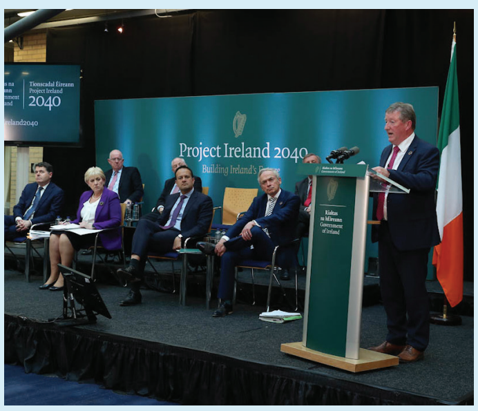
Speaking at the media launch of the National Broadband Plan with Taoiseach Leo Varadkar and Ministers Donohoe, Humphreys, Bruton, Flanagan, Ring and Creed.

The Broadband Connection Point in your area is at Tierneevin National School . The BCP's have been specifically selected by local authorities and their Broadband Officers to provide Wifi and other facilities in advance of the main deployment of the National Broadband Plan.