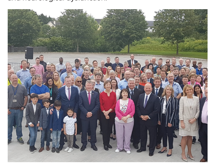
Official opening of NATUS new facility

ailments such as hearing impairment, epilepsy, sleep disorders, newborn jaundice, newborn metabolic testing and neurological dysfunction.